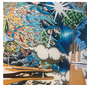
EXHIBIT: SAT APRIL 13TH-SUNDAY MAY 12TH